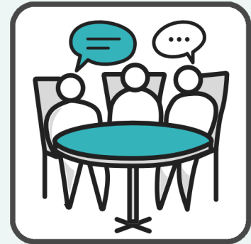
Supported Community Connections