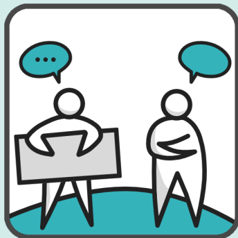
Community Employment & Vocational Services